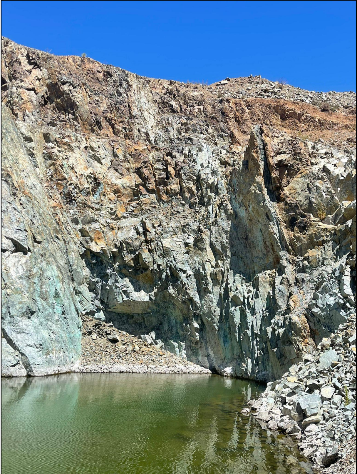
Figure 3. Historic Colo Copper-Gold Mine at Colina2 with visible malachite