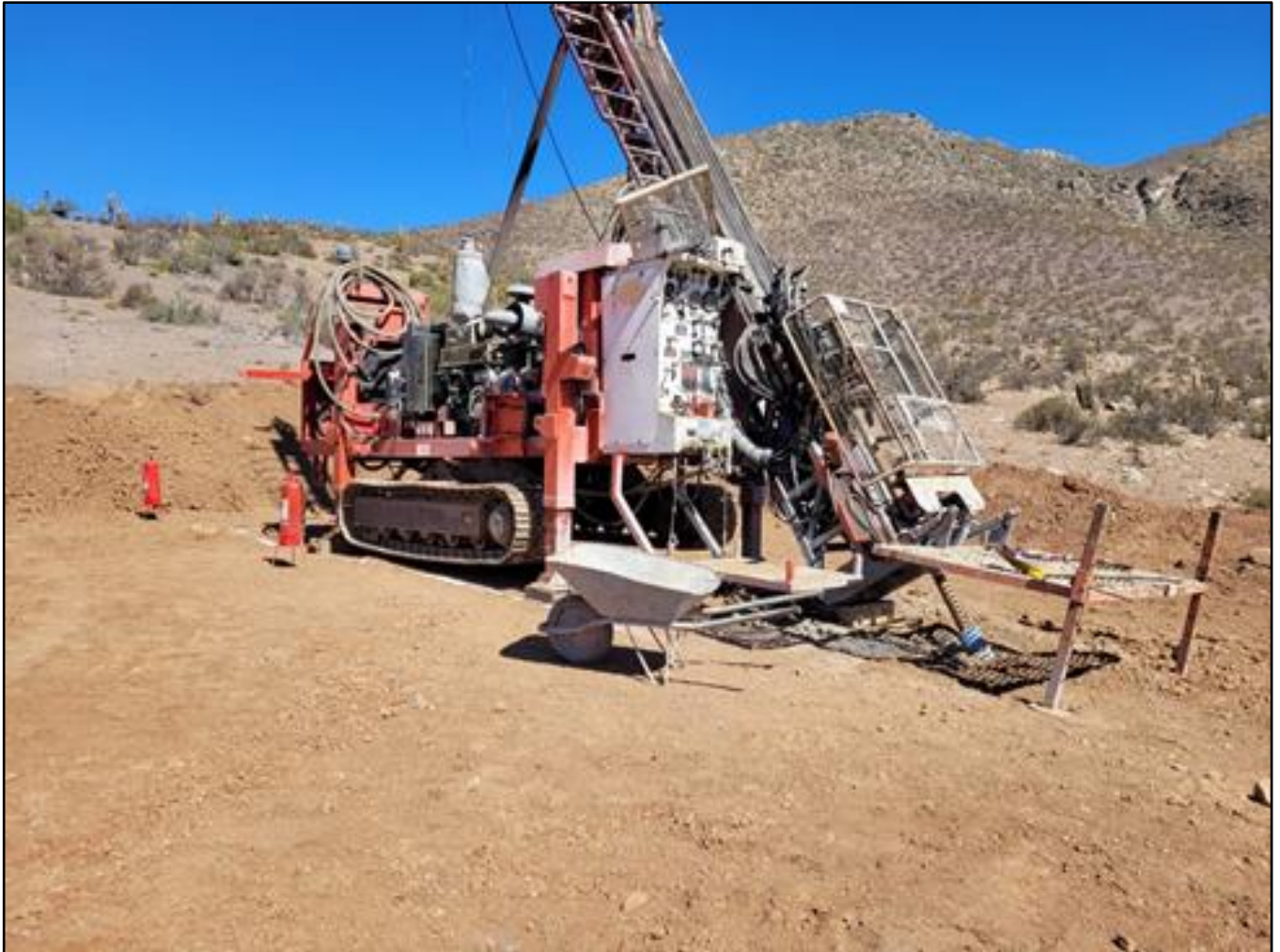
Figure 2. Diamond drill rig in operation at Colina2