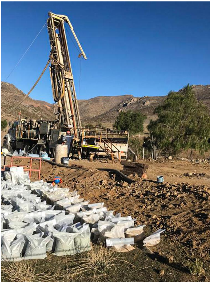
Fig 1. RC drilling at Colina2 July 2021

RC drilling at Colina2 is progressing very well, the first batch of samples have been submitted to ALS Laboratories Santiago, and results are expected in approx. 5-6 weeks. Epithermal style gold mineralisation is the target, as discovered in the trenching work (ASX release 18/11/2020).